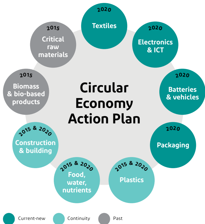
Figure 2. Evolution of the Circular Economy Action Plan.

In March 2022, a new EU Strategy for Sustainable and Circular Textiles was published. This strategy is part of the 2020 Circular Economy Action Plan, which evolved from 2015 to 2020 and now includes textiles due to the high potential for circularity of the sector, as shown in Figure 2.